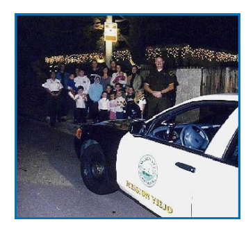
Effective partnerships with neighbors and local law enforcement