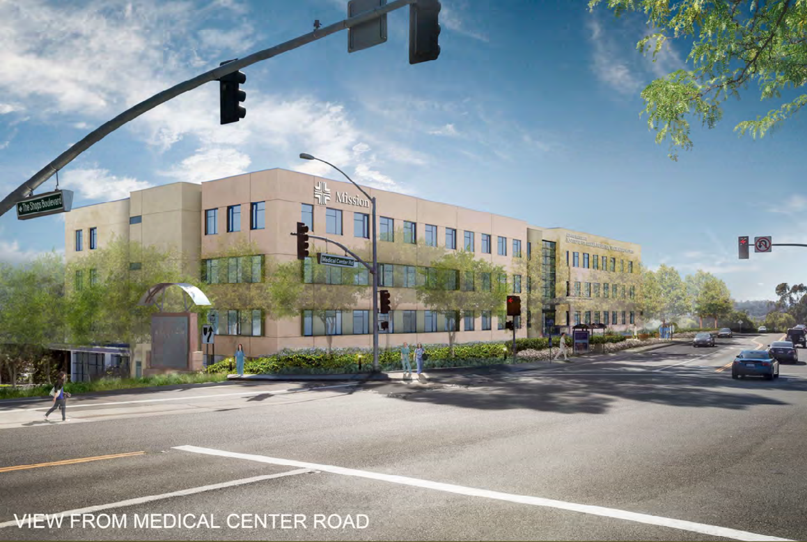
VIEW FROM MEDICAL CENTER ROAD

The institute expands Mission Hospital's role as one of six facilities with Commission on Cancer accreditation as comprehensive cancer treatment centers in Orange County.