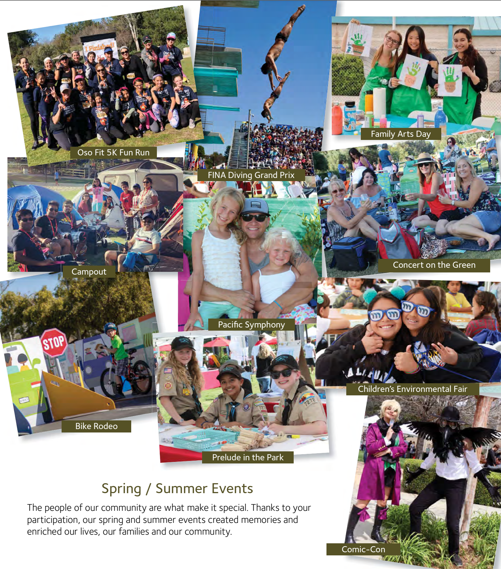
Oso Fit 5K Fun Run