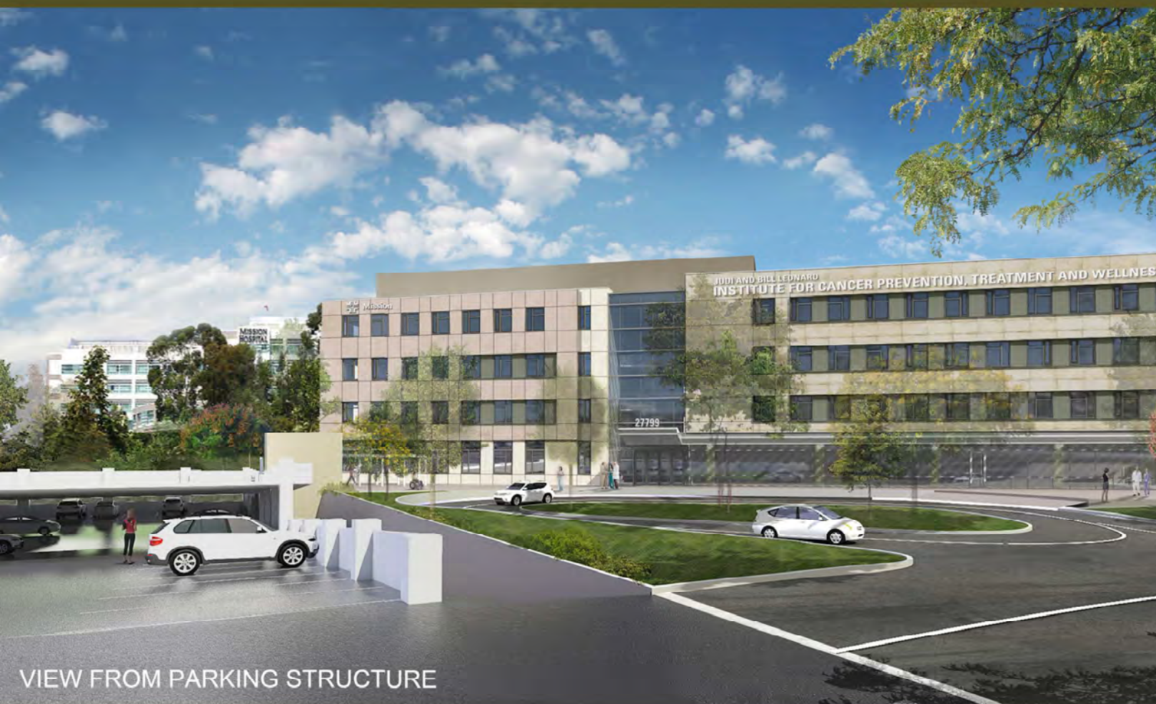
VIEW FROM PARKING STRUCTURE