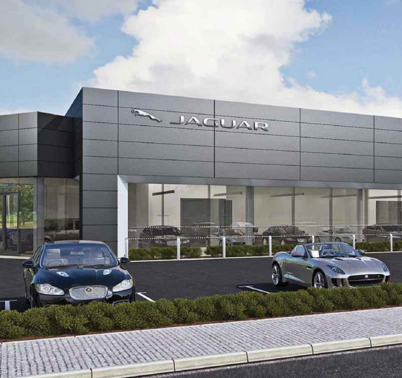
Jaguar-Land Rover Improvements