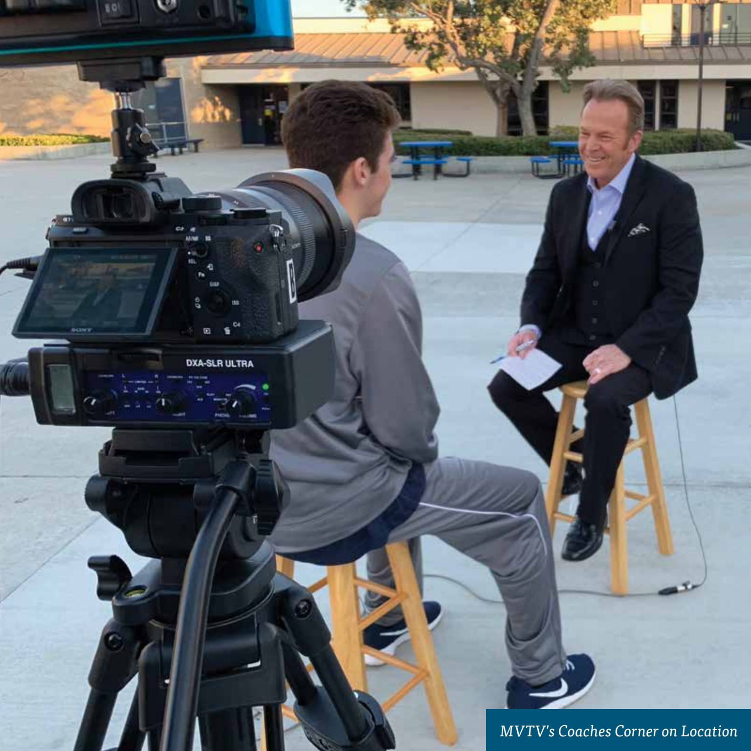
MVTV's Coaches Corner on Location