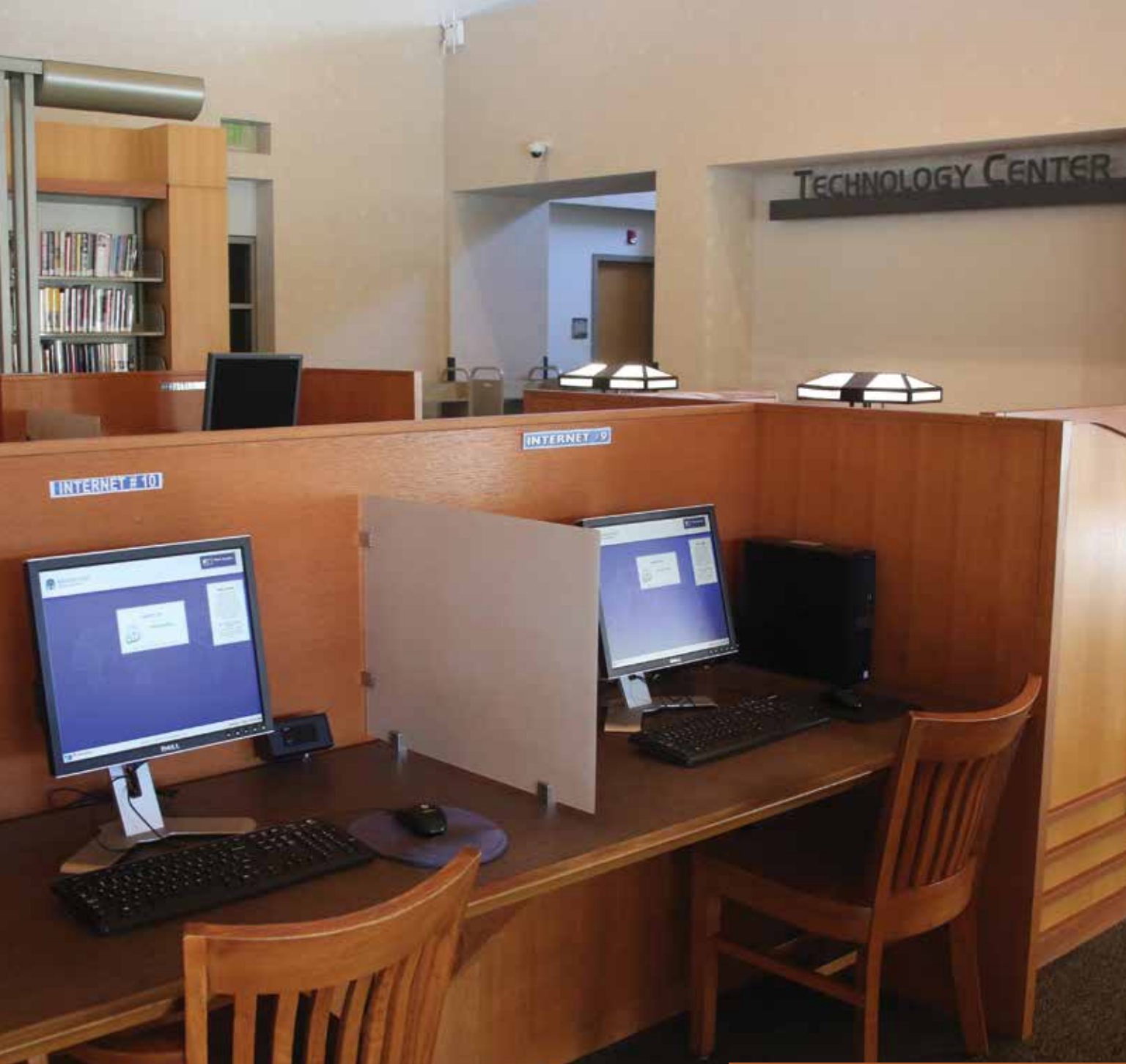
New Computers in Tech Center