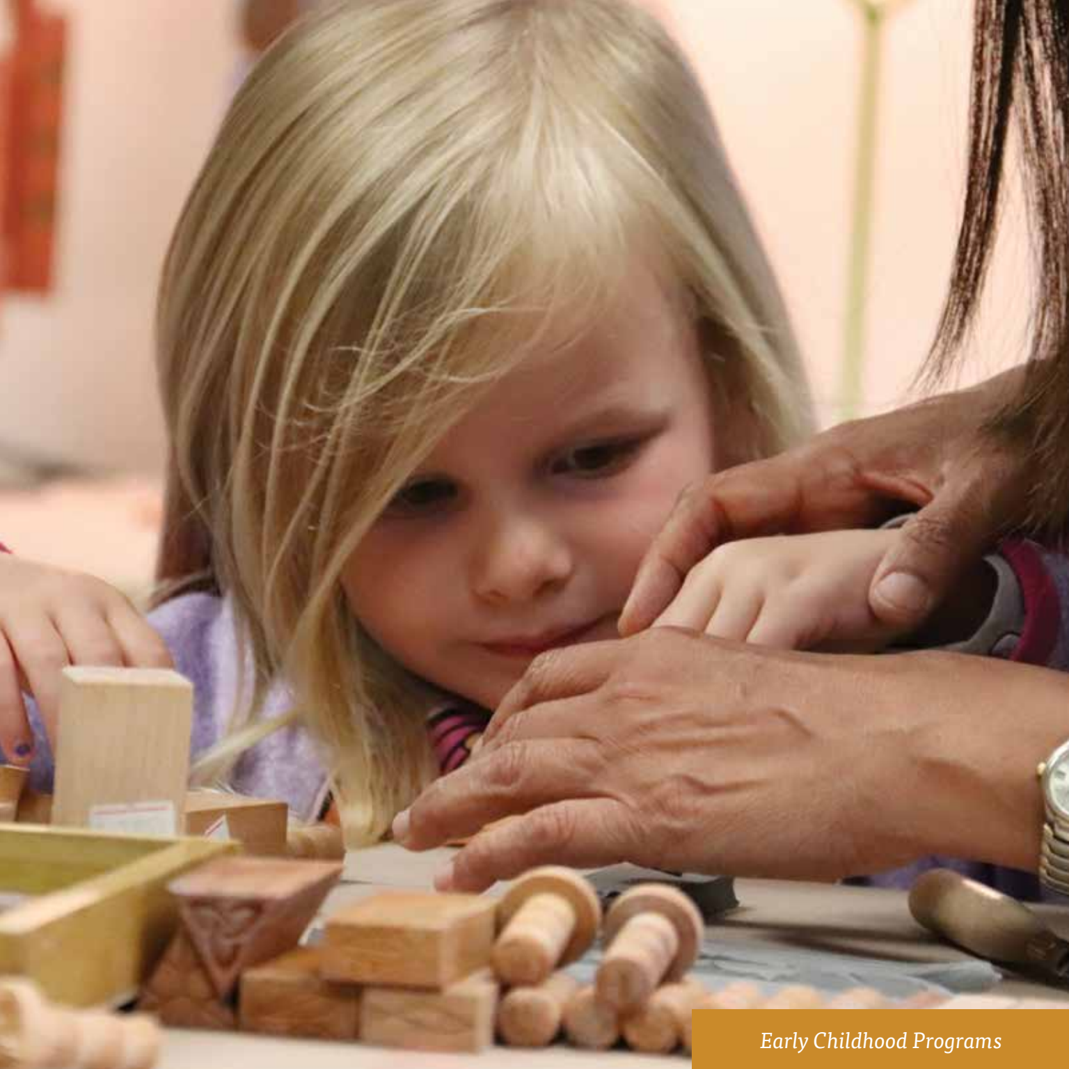
Early Childhood Programs