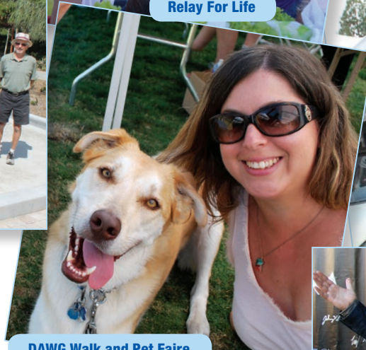
DAWG Walk and Pet Faire