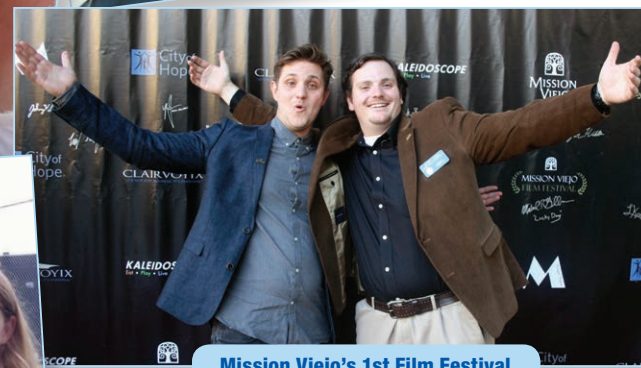
Mission Viejo's 1st Film Festival