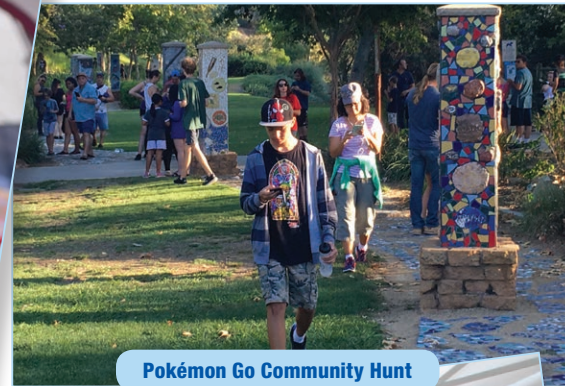
Pokémon Go Community Hunt