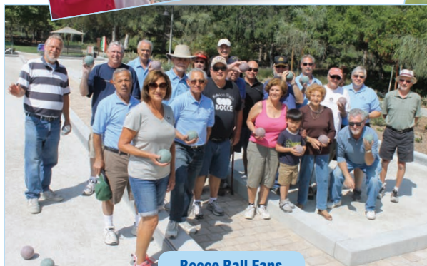
Bocce Ball Fans