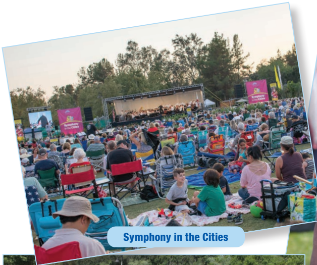
Symphony in the Cities