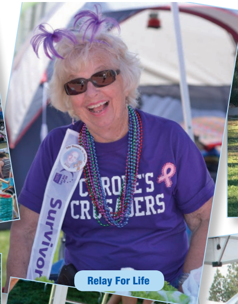
Relay For Life