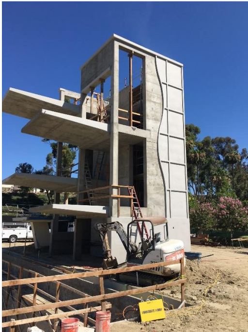
Dive Tower with "Sacked Smooth Finish"