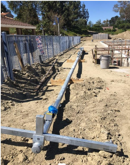
Musco Pole on ground