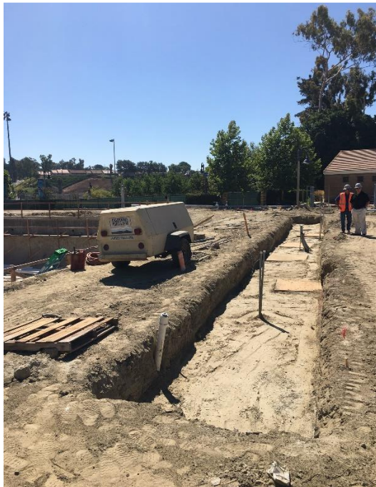
Wall of Recognition Foundation