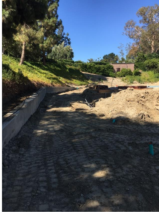
Ground Preparation for the New Ramp to the Activity Pool