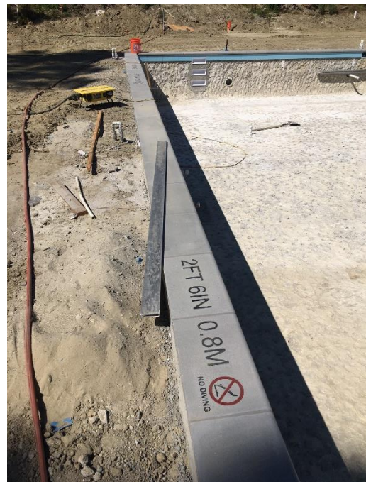
Activity Pool New Coping