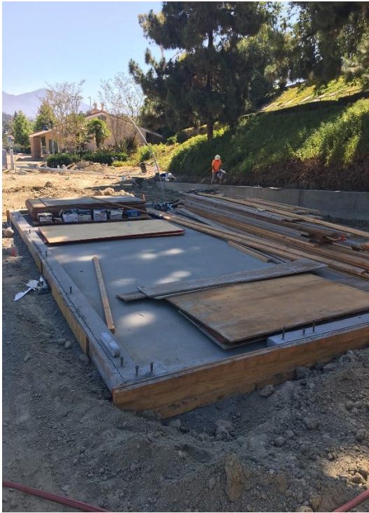
First Tuff Shed Foundation Mechanical Room