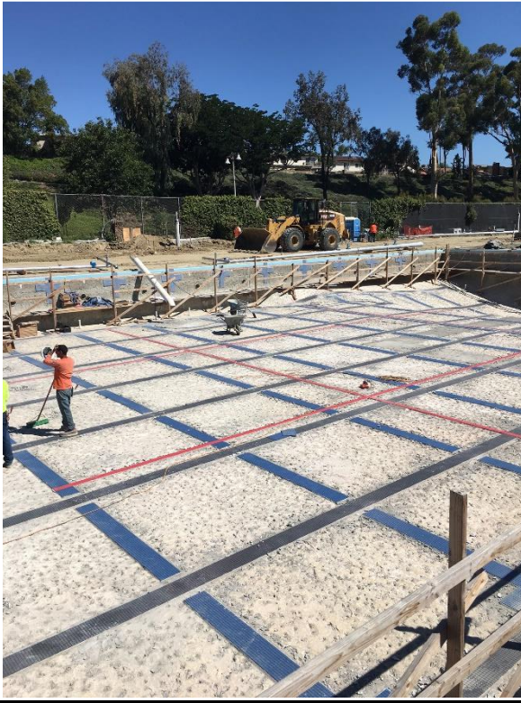
New Lane Marking Tile – 50 Meter Comp Pool