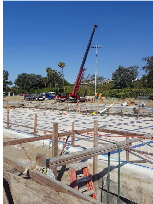
Musco Pole lifted in the air by the Crane