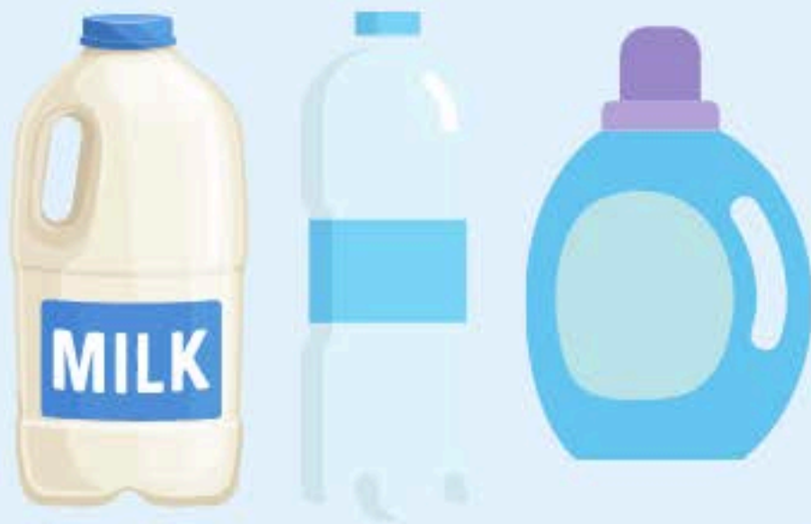
PLASTIC DRINK BOTTLES DETERGENT CONTAINERS JARS & TUBS MILK JUGS

TIP: REUSE IS JUST AS IMPORTANT AS RECYCLING. MANY ITEMS CAN BE EASILY REUSED!