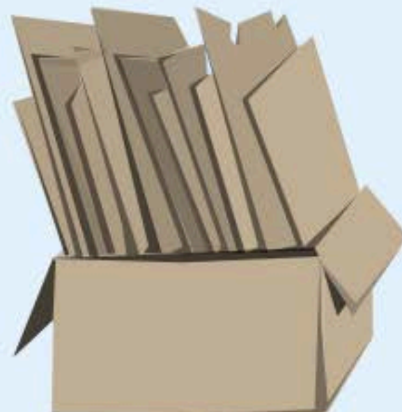
PAPER CARDBOARD MAIL MAGAZINES NEWSPAPER

NO PLASTIC BAGS STYROFOAM ORGANICS HAZARDOUS WASTE BATTERIES ELECTRONICS LIQUIDS