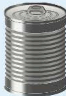
METAL ALUMINUM & TIN CANS